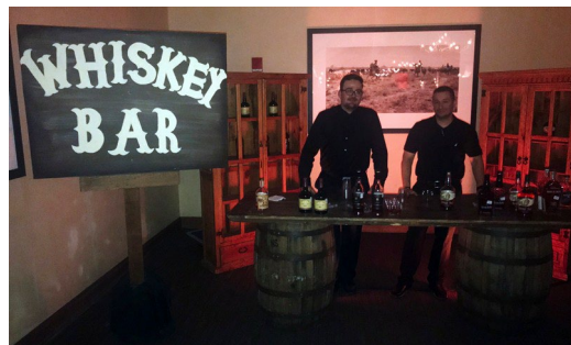
EXAMPLE OF WHISKEY TASTING BOOTH SHOWN ABOVE

Simply Lime Margarita, Chocolate Whiskey Ice Cream Cocktail, Peach Bellini, Sinfully Scotch Ice Cream Cocktail, Cranberry Cocktail, Strawberry Margarita, Amaretto Freeze, Piña Colada, or White Russian Ice Cream Cocktail